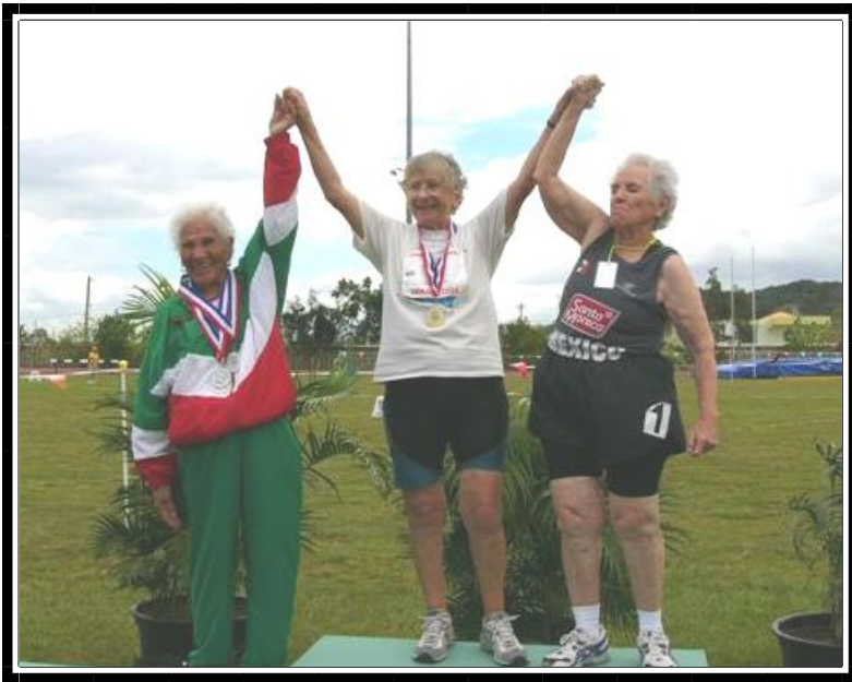
W85 Olga Kotelko won 10 Gold medals